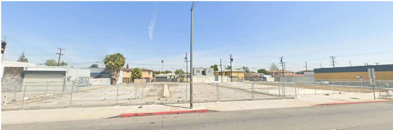
Figure 4-3: Site on Compton Boulevard

Site on Compton Boulevard includes 10 parcels and is fenced in as one property.