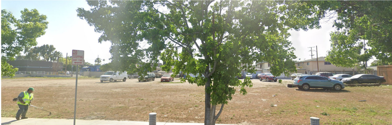
Figure 4-2: Vacant Site at School Street/Willowbrook Avenue

Vacant site at School Street/Willowbrook Avenue includes 9 parcels and has no indication that the parcels function or would be developed separately.