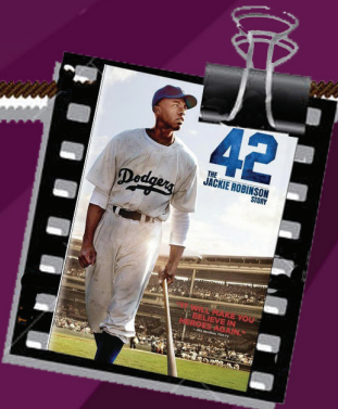
42- June 9th Gonzalez Park

Traiga sus Cobijas, Sillas y Toda La Familia