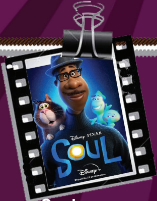
Soul- June 23rd Leuders Park