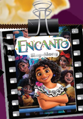
Encanto- Aug 4th (Película en Español) Leuders Park

CONTACT: 310-605-5688 | CONTACTRECREATION@COMPTONCITY.ORG | COMPTONCITY.ORG