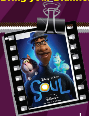
Soul- June 23rd Leuders Park