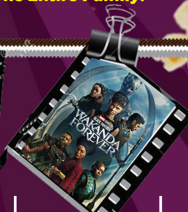
Black Panther Wakanda Forever- July 21st Kelly Park