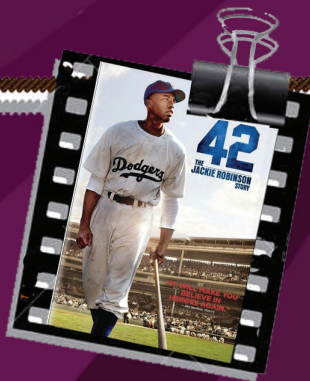
42- June 9th Gonzalez Park

MOVIES BEGIN AT DUSK Bring your Blankets, Lawn Chairs & The Entire Family!