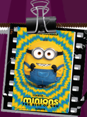
Minions the Rise of Gru- July 7th Burrell- MacDonald Park