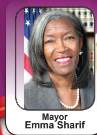
Mayor Emma Sharif