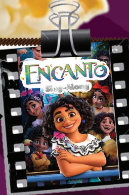
Encanto- Aug 4th (Película en Español) Leuders Park

CONTACTAR : 310-605-5688 | CONTACTRECREATION@COMPTONCITY.ORG | COMPTONCITY.ORG