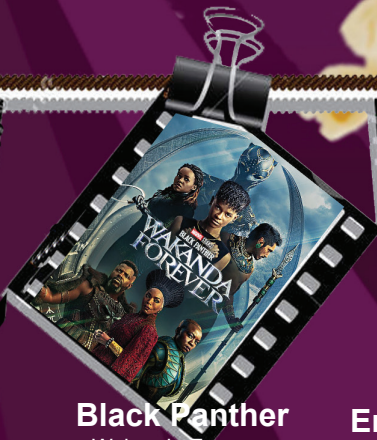
Black Panther Wakanda Forever- July 21st Kelly Park