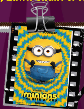
Minions the Rise of Gru- July 7th Burrell- MacDonald Park